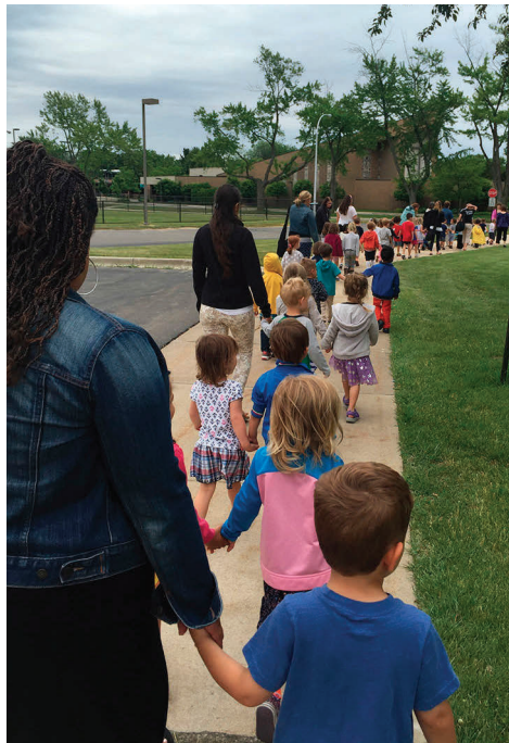
Every one of the public safety departments assisted with our evacuation drills. Here they helped the students at Barnes.