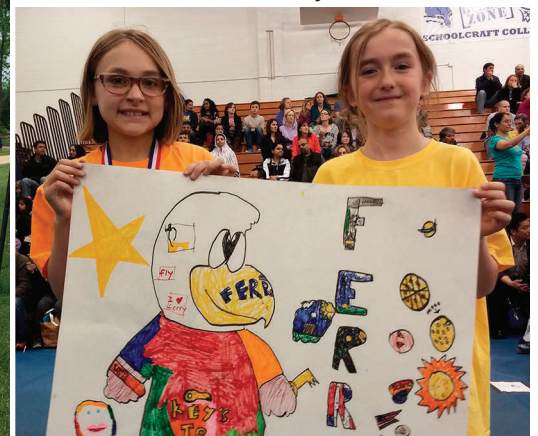
Students like these from Ferry represent our district at competitions ranging from Destination Imagination to Robotics to Solar Car.