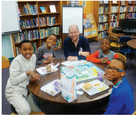
Local Rotarians have been using their lunch hour to support lunchtime enrichment activities at Poupard Elementary School.

Last fall we reported both high schools ranked in the top 5% of the nation according to the Washington Post, and South in the top 2% according to U.S. News. Recently, GPPSS was ranked #3 district in the state, our teachers were ranked #1, and all of our elementary schools placed in the top 10% according to Niche.com.