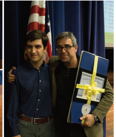
The Raymond & Jane Cracchiolo Foundation supported the South Commercial Foods Program