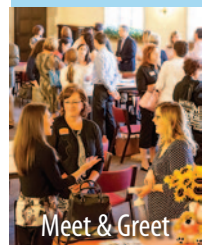
Meet & Greet