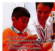
Gary Sharp, National Inventors Hall of Fame Inductee, inventor of 3D Projection Systems